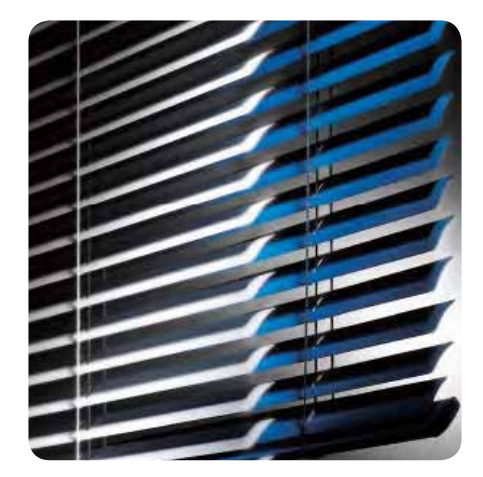
ALUMINIUM VENETIAN BLINDS